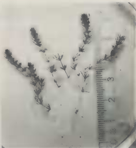
Figure 1. - Lamprothamnium papulosum . Photo of a specimen collected 31.08.1994 in Kalvöfjorden, Sweden. The length of this plant is c. 5 cm.